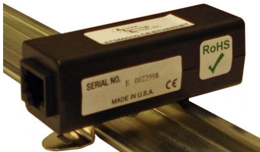
AT25001D shown mounted on 35 mm DIN rail

Surge suppression technology for your rack mounted lines and connected devices.